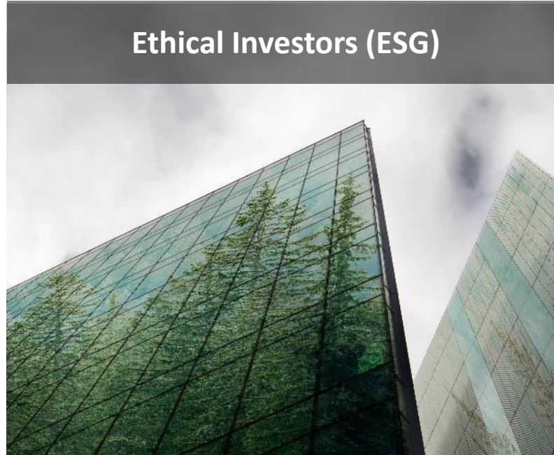
Ethical Investors (ESG)