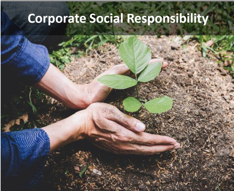
Corporate Social Responsibility